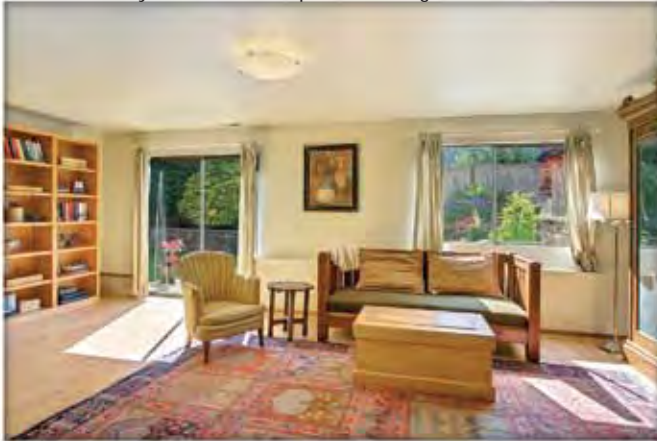
Huge family room steps out to backyard!