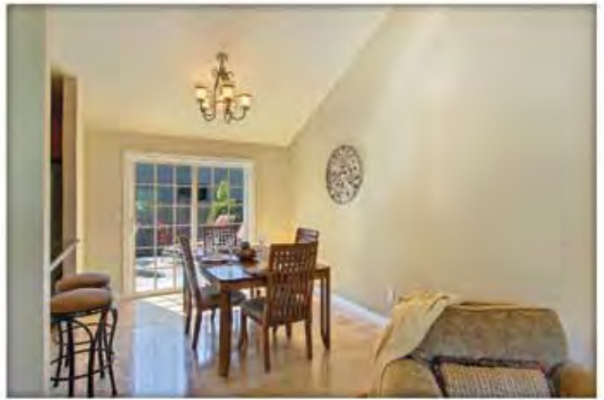
Formal dining, bar seating, & maple hardwoods! Steps out to newly designed patio & garden terrace!