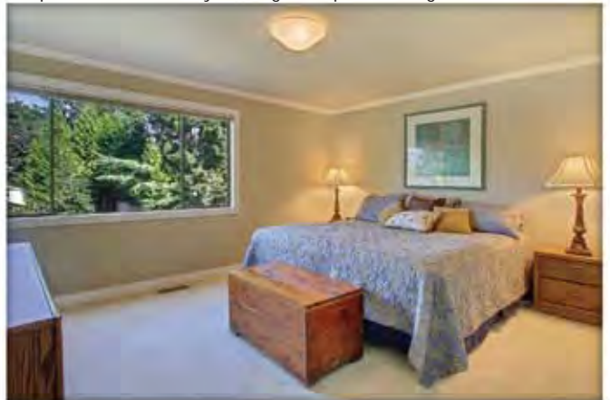
Generous Master includes two walk-in closets!