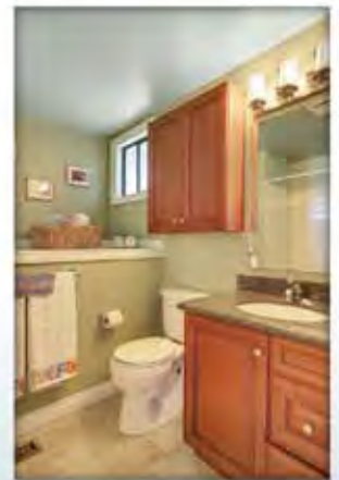
All New Hall Bath!