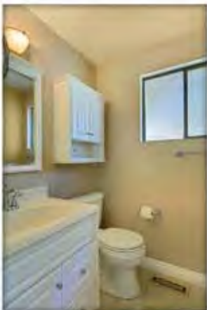
White on white style!