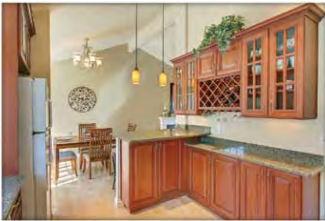
All new kitchen & vaulted ceiling! Cherry stained maple, slab granite & more!