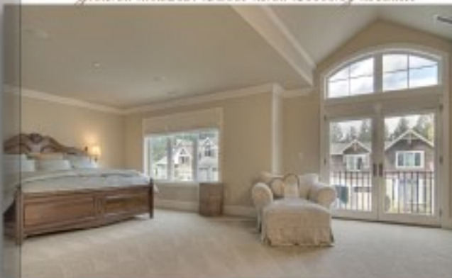
Grand master suite and sitting area...