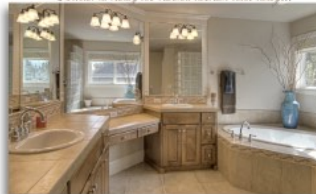
What a way to wind down the day...