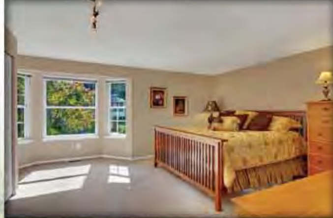
Generous Master Suite with Bay window!