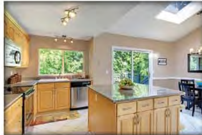
Island kitchen for everyday functionality and entertaining!