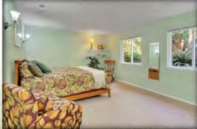
Large bedrooms not often found in this neighborhood!