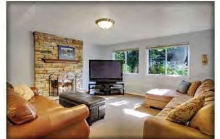
Family room makes a great Media Room!