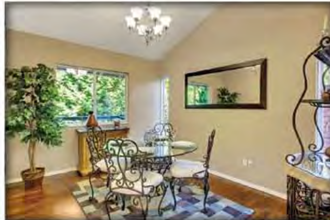
Rich mahogany hardwood flooring throughout.