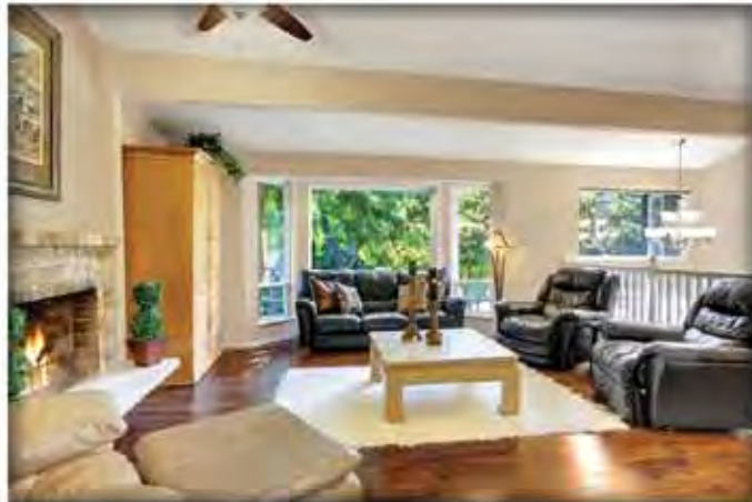
Soaring vaulted ceilings flooded with natural light!