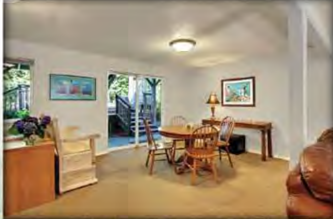
Spacious family room for pc area, hobbies and more!