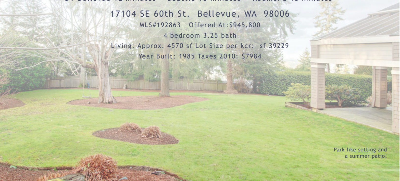
Park like setting and a summer patio!