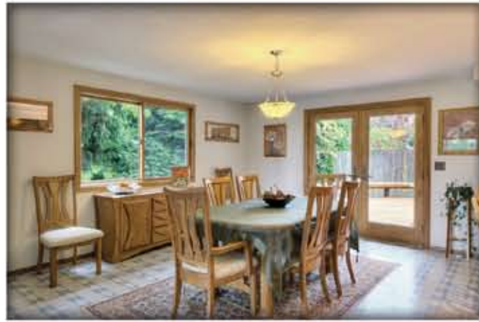
The dining room is part of the open flow concept.