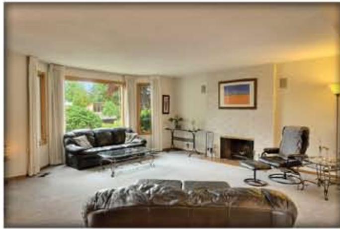
Open living with room to spare...