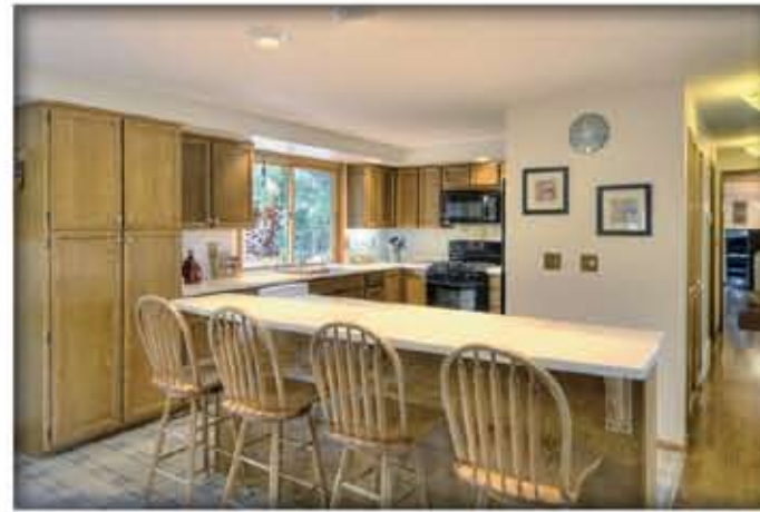
Bar height seating is perfect for entertaining as well.