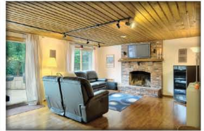
Family room makes a great Media Room!