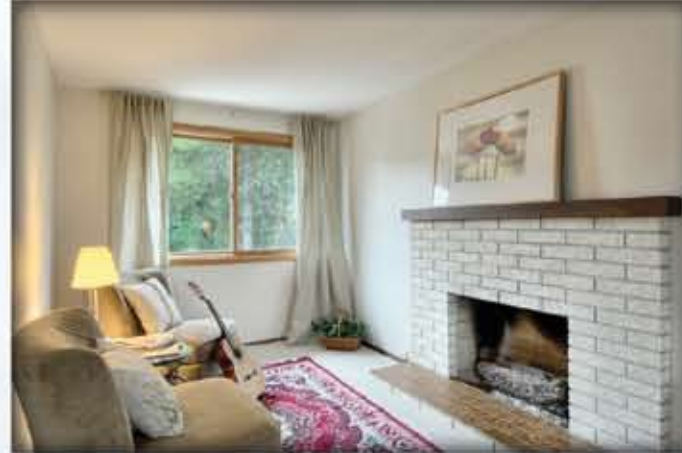
Sitting area and fireplace in Master Suite.