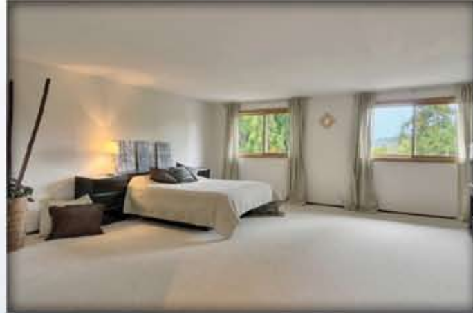
Master Suite Retreat... look at the proportions!