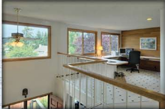
Upstairs loft for computer area, hobbies and more!