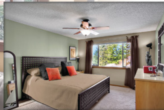
Master suite with peekaboo view of lake.