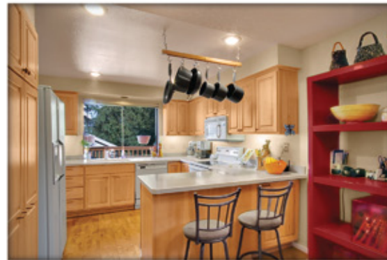
Kitchen is updated with hardwood cabinets and corian counter tops. All new flooring.