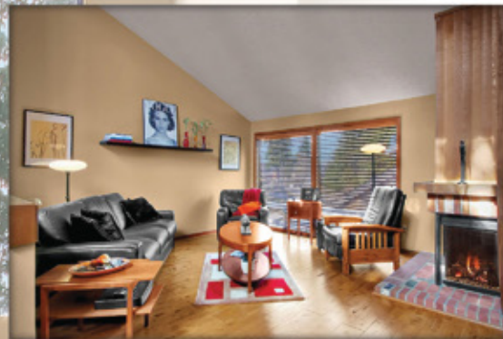
Formal living room filled with natural light.