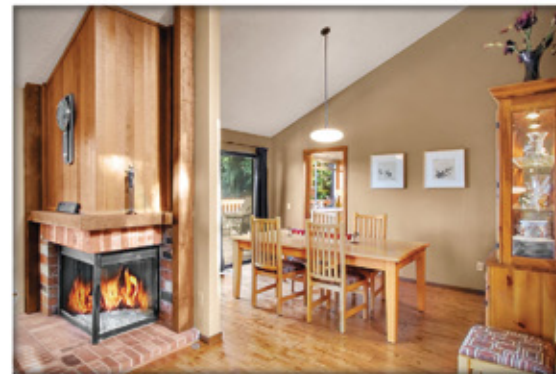
Formal dining flows openly to living room, kitchen, and wrap around deck.