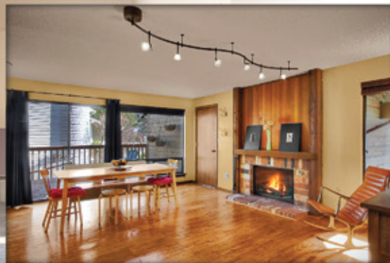
Family room with warmth and functionality. Wrap around deck compliments the space.